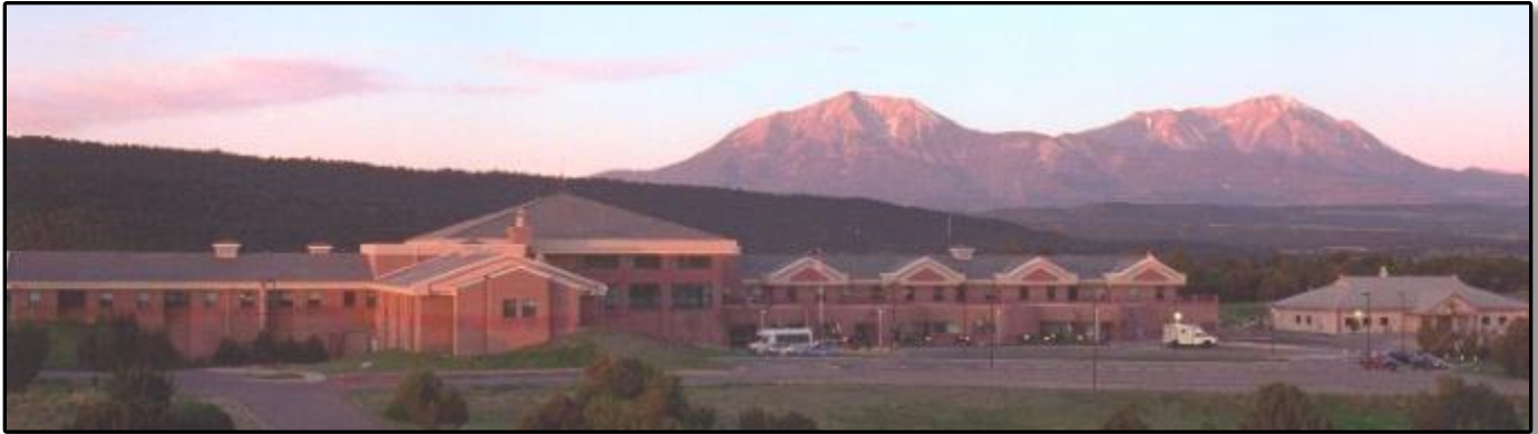
Spanish Peaks Regional Health Center / Spanish Peaks Veterans Community Living Center & Specialty Clinic

The SPVCLC is a 120-bed non-skilled nursing home facility offering a memory care unit for those Residents with Alzheimer's Disease and dementia special needs. It is easily accessible via Interstate 25 just a few miles west from the town of Walsenburg on US Hwy 160. Visitation is 24-hours a day and seven days a week.