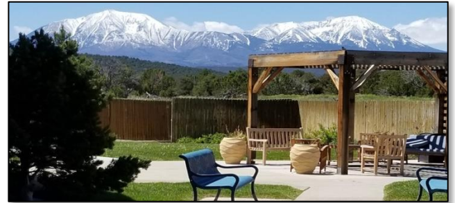
Spanish Peaks Mountain View from West-side Outdoor Area